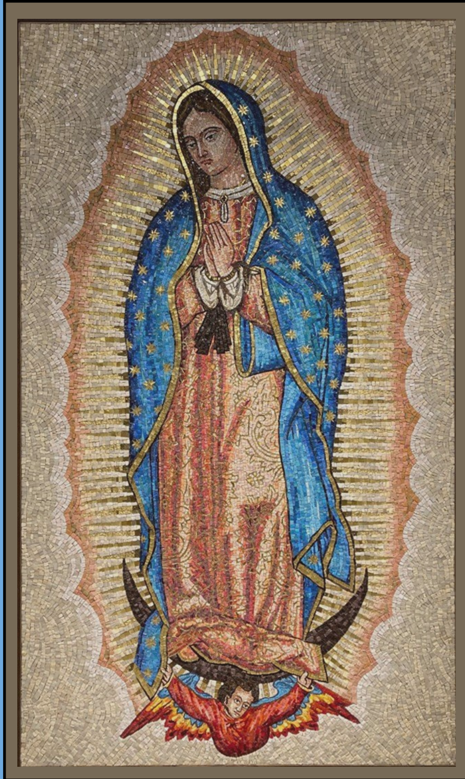
Mosaic Image of Our Lady of Guadalupe, Cathedral of Mary of the Assumption, commissioned by Bishop Joseph Cistone, crafted in Italy.