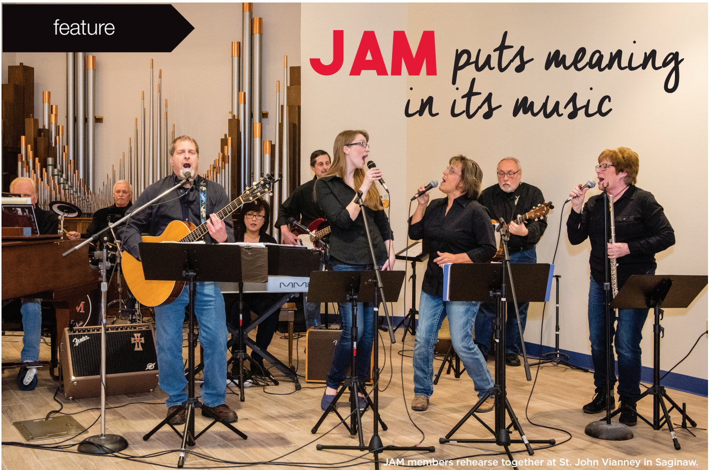
JAM members rehearse together at St. John Vianney in Saginaw.

I t is a cold Monday evening in an especially harsh winter, but the sounds filling St. John Vianney Church in Saginaw are warm and bright as members of the musical group JAM prepare for a rehearsal. Piano keys ping. Guitars strings hum. Even a tambourine claps a cadence as the musicians warm up.