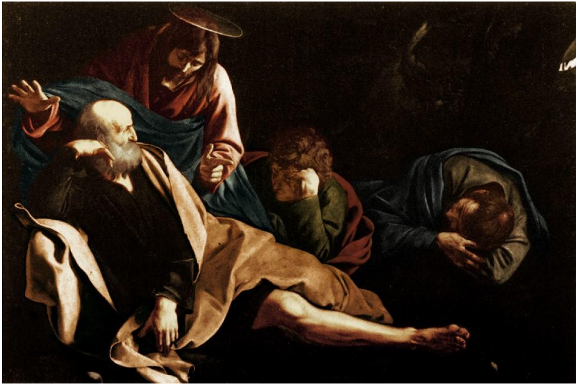
Christ in the Garden, Michelangelo Merisi da Caravaggio

Children/Family Session #2: Praying with Jesus in the Eucharist: ARRR (Acknowledge, Relate Receive, Respond)