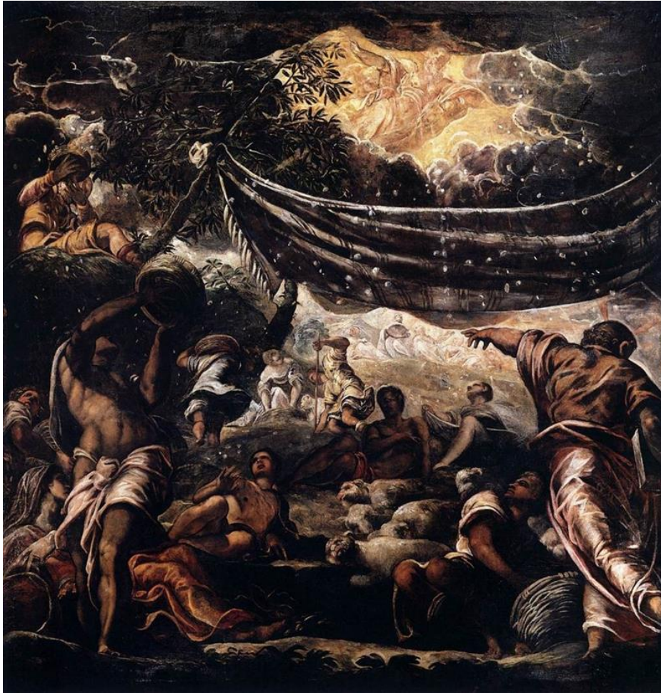
The Miracle of Manna, Tintoretto

Child/family Session #5: The Scriptural Basis of the Eucharist