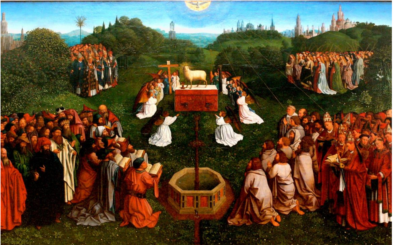
Adoration of the Mystic Lamb, Jan van Eyck

Child/Family Session #6: The Mass: Sacrifice, Thanksgiving, Memorial, Presence