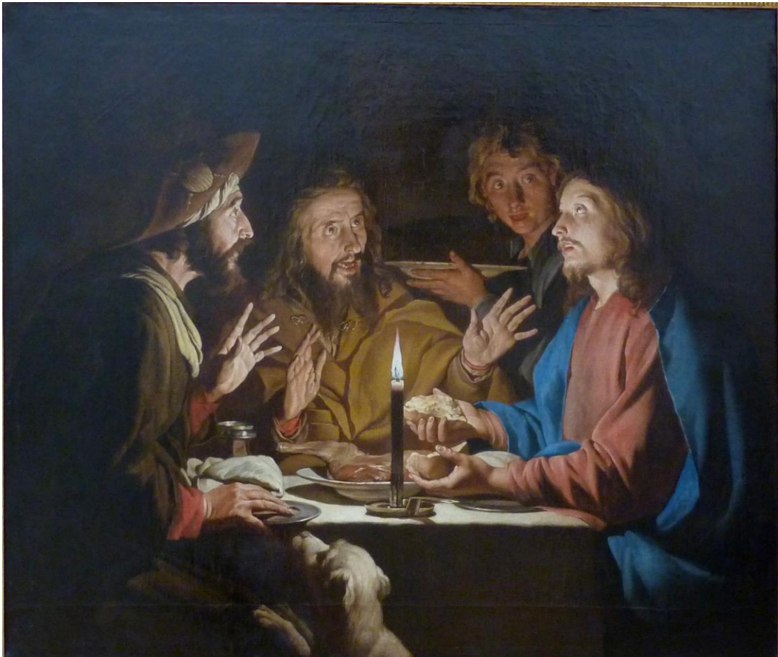
Supper at Emmaus with Candlelight, Matthias Stom

Child/family Session #4: The Eucharist – Presence, Communion, Sacrifice--Source & Summit!