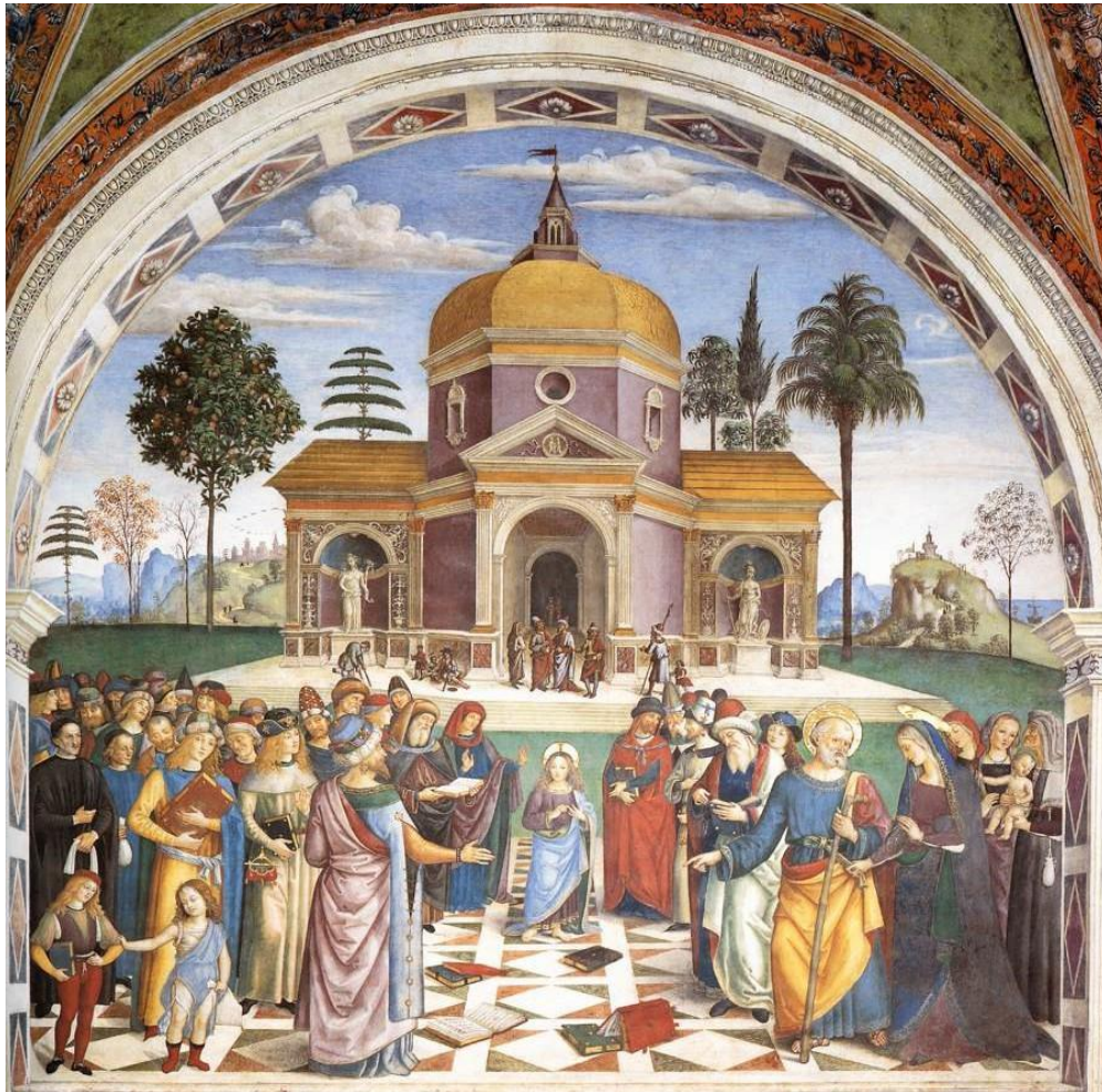
Christ Among the Doctors, Pinturicchio

Child/Family Session #3: Praying with Jesus in the Eucharist: Lectio Divina