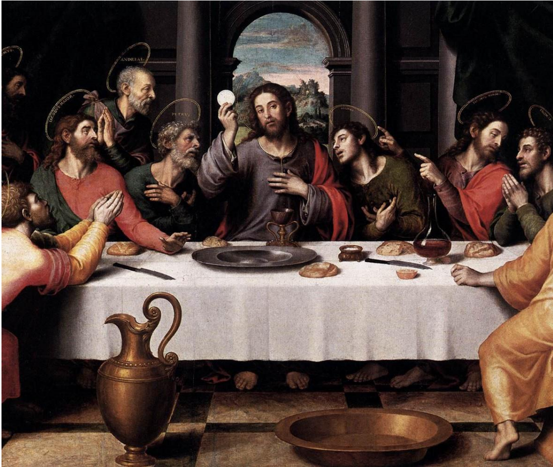
The Last Supper, Juan de Juanes