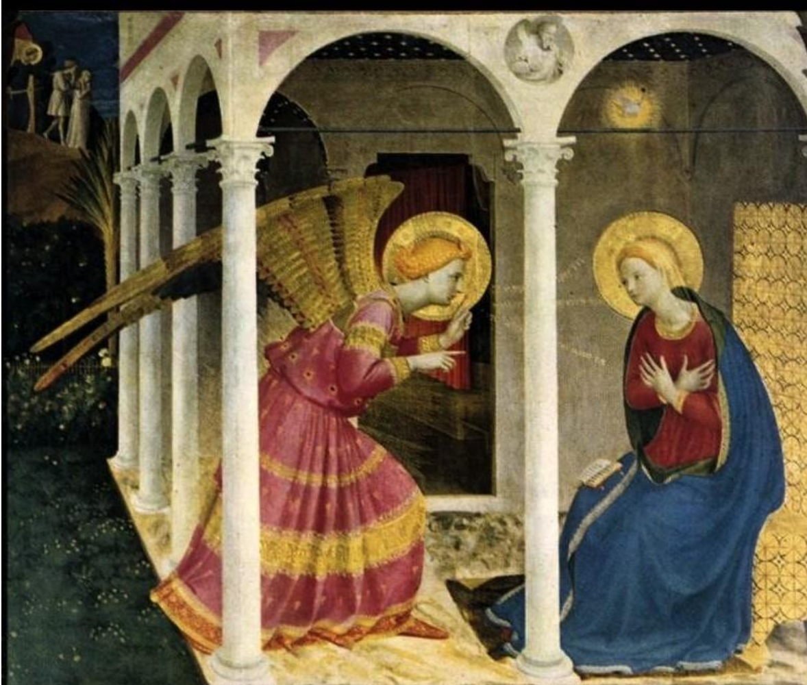
Annunciation, Fra Angelico

Child/Family Session #8: Annunciation: Mary, Mother of the Eucharist