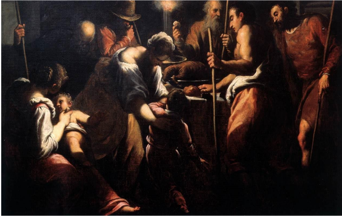
Passover, Palma Giovane Web Gallery of Art

Child/family Session #5: The Scriptural Basis of the Eucharist