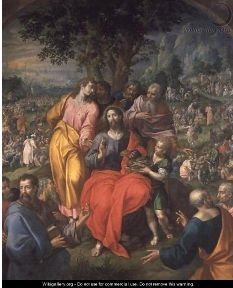
The Feeding of the Five Thousand, Hendrick de Clerck

Child/family Session #5: The Scriptural Basis of the Eucharist