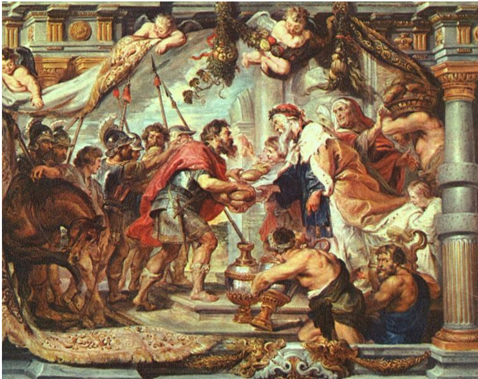
The Meeting of Abraham and Melchizedek, Peter Paul Rubens

Child/family Session #5: The Scriptural Basis of the Eucharist