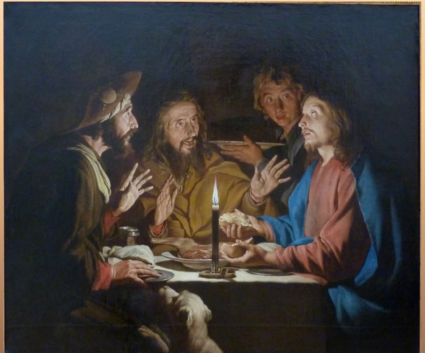
Supper at Emmaus with Candlelight, Matthias Stom

Child/family Session #4: The Eucharist – Presence, Communion, Sacrifice-- Source & Summit!