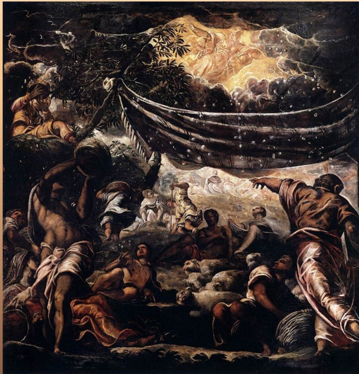
The Miracle of Manna, Tintoretto Web Gallery of Art

Child/family Session #5: The Scriptural Basis of the Eucharist