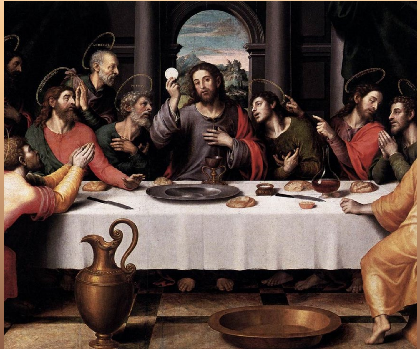
The Last Supper, Juan de Juanes

Child/family Session #1: Encountering Jesus in the Eucharist