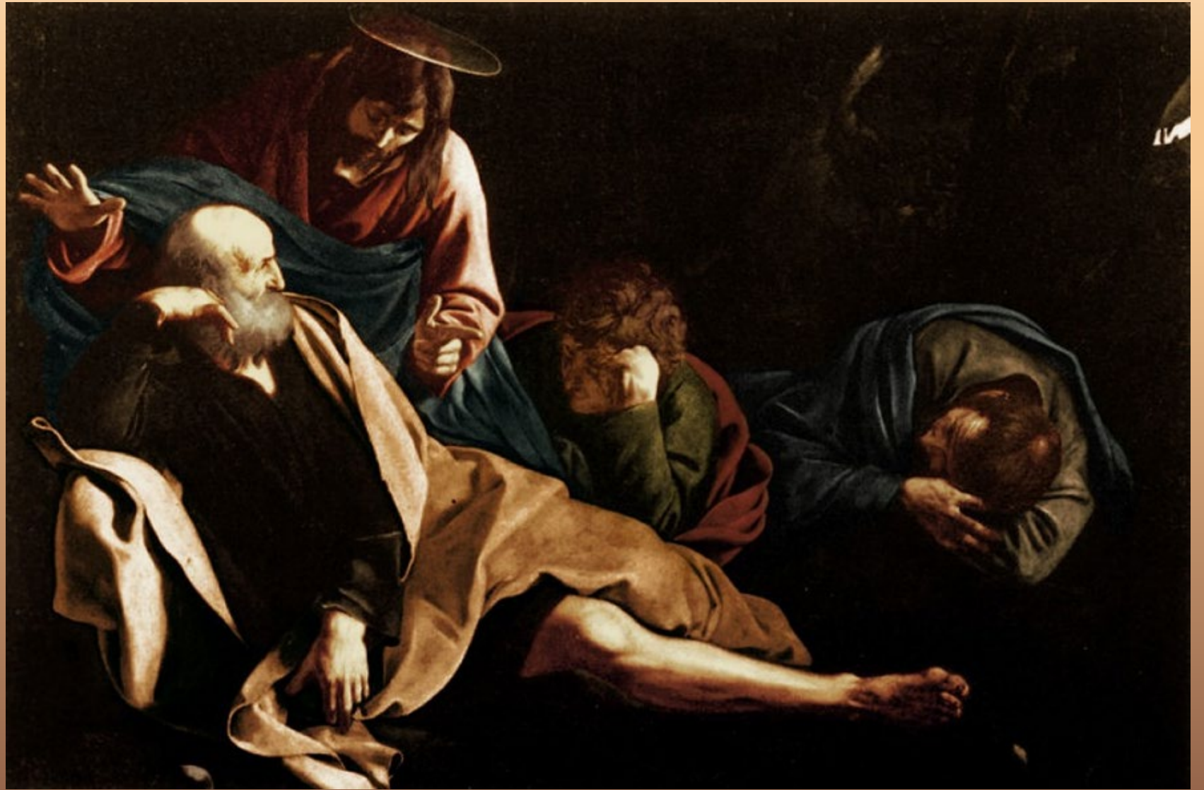
Christ in the Garden, Michelangelo Merisi da Caravaggio

Children/Family Session #2: Praying with Jesus in the Eucharist: ARRR (Acknowledge, Relate Receive, Respond)