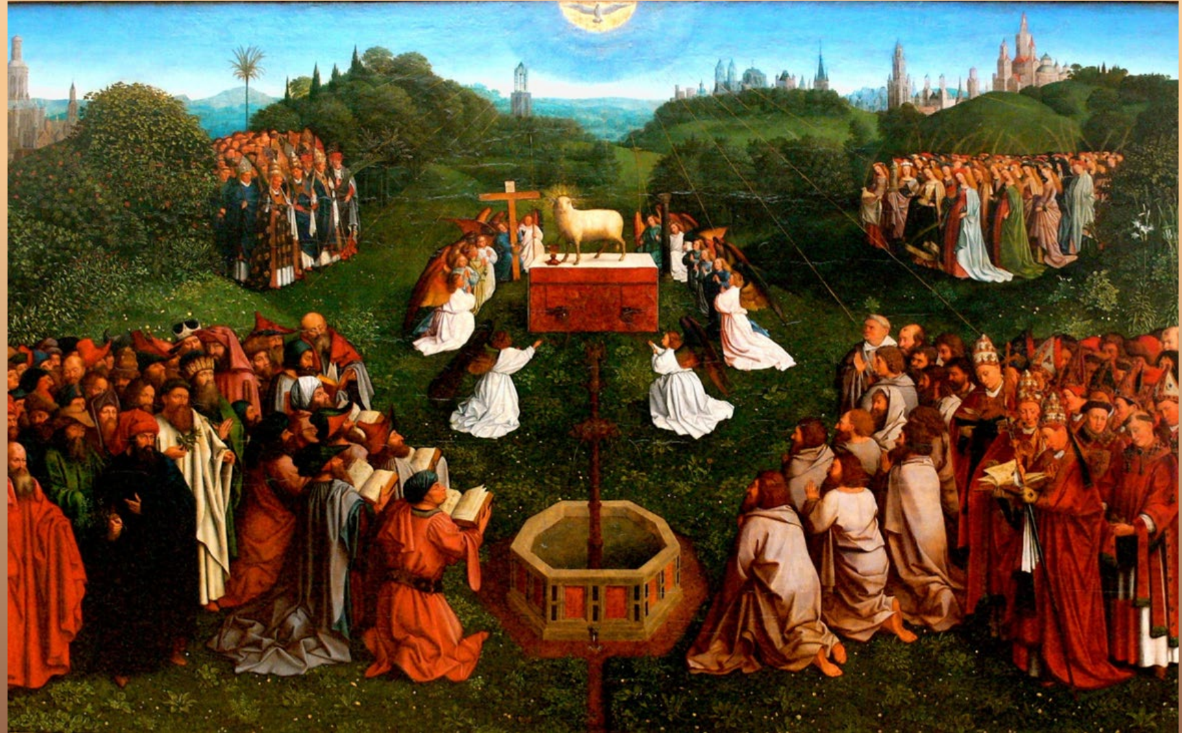
Adoration of the Mystic Lamb, Jan van Eyck

Child/Family Session #6: The Mass: Sacrifice, Thanksgiving, Memorial, Presence