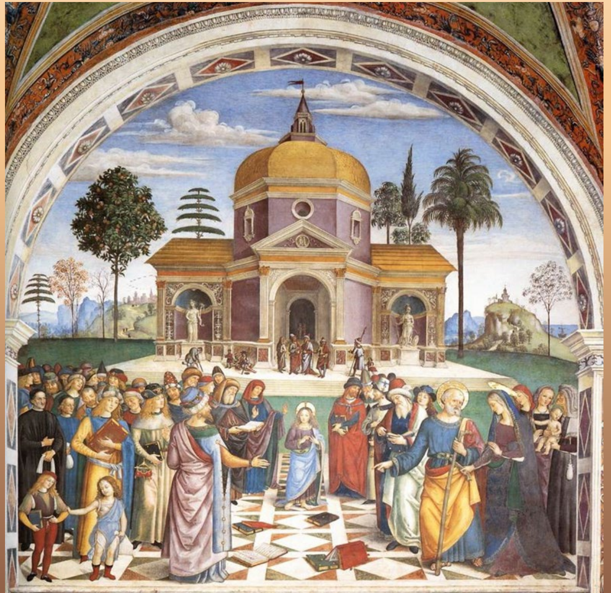
Christ Among the Doctors, Pinturicchio

Child/Family Session #3: Praying with Jesus in the Eucharist: Lectio Divina