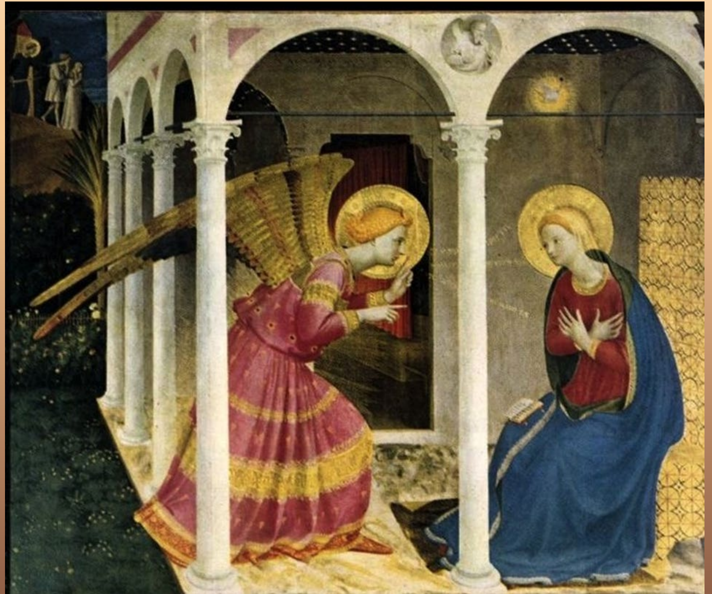
Annunciation, Fra Angelico

Child/Family Session #8: Annunciation: Mary, Mother of the Eucharist