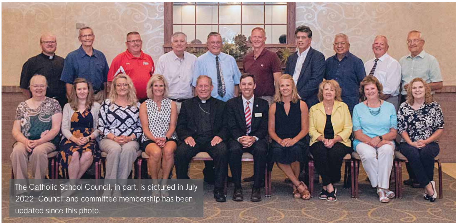
The Catholic School Council, in part, is pictured in July 2022. Council and committee membership has been updated since this photo.